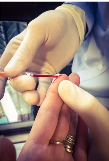
Here are my results